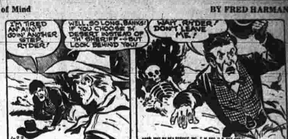
A CHANGE OF MIND