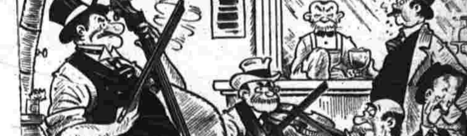
THE HAPPIEST PEOPLE