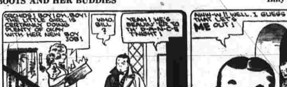
BOOTS AND HER BUDDIES