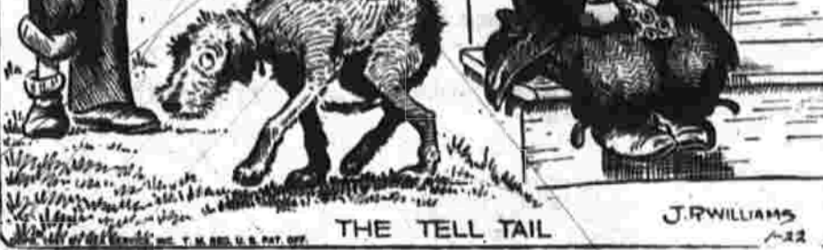
THE TELL TAIL